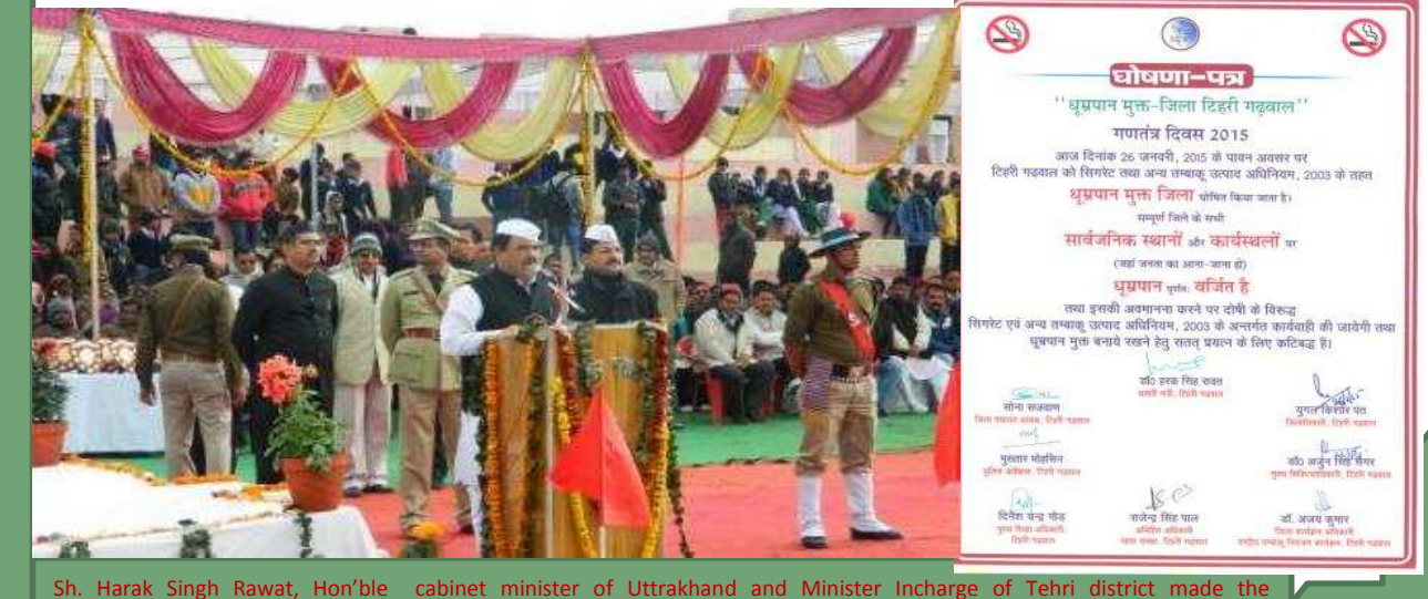
announcement at the republic day parade at stadium Tehri on 26<sup>th</sup> Janaury 2015 declaring entire district smoke free

and District tobacco Control Cells backed by all the stakeholders in Tehri district and widely covered by electronic and print media. As a result of concerted efforts by all stakeholders, Balajee Sewa Sansthan- with technical support from the "UNION" and District Administration Tehri succeeded in implementing the smoke free guidelines in Tehri district culminating in its declaration as smoke free. Sh. Harak Singh Rawat, Hon'ble Minister Incharge of Tehri district made the announcement at the republic day parade at stadium Tehri on 26 <sup>th</sup> Janaury 2015 declaring entire district smoke free