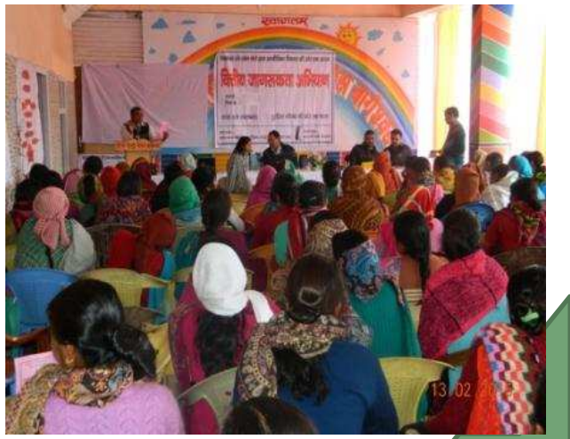
Financial literacy workshop in Almora district

sections in later part of this report. All we can say that organizations or the people are known by their deeds.