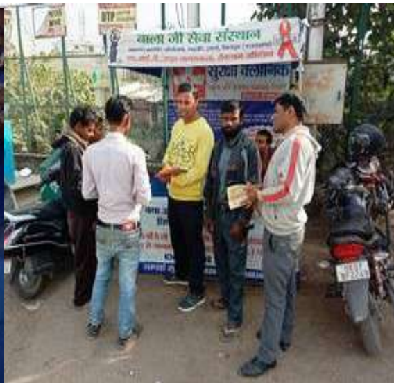
Health Camp organised by Balajee Sewa Sansthan

The Organisation also Educate migrants about the use and benefits of using condoms for living a healthy and protective life through nukkar natak as well as using IEC materials. Last year we have found more than 8 new positive cases which is very alarming and challenges increasing day to day basis.