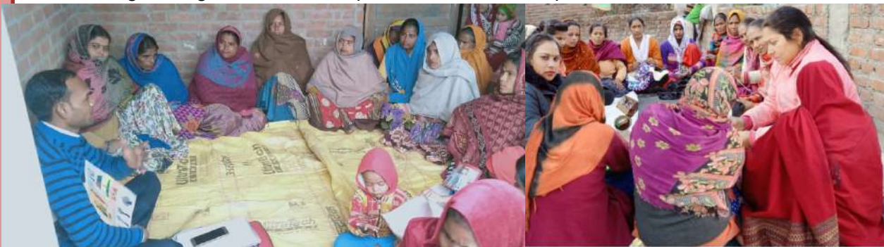
Self Help Group Meeting in Bareilly and Dehradun district

A self help group is a rural poor group of 10-20 member constituted to organise themselves to eradicate poverty. Balajee Sewa Sansthan has formed more than 625 SHGs till the year 2019-20 by the financial support of NABARD, Dehradun & Lucknow Region. BSS all ready formed and linked with Bank of 50 SHGs of BPL family for DRDA Dehradun in Sahaspur Block. In last Year more than 115 lakh saving created by SHG members and utilizing for inter loaning among the member as per her needs and requirements