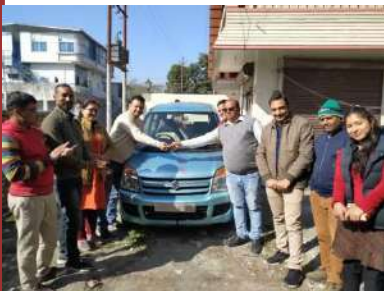
Vehicle handover to team for Program Deep purchase Competition Deepawali with Team Chhath Puja with migrant