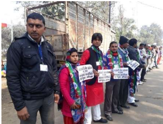
Human Chain for Nasha Mukt, Dowry Free and Child marriage free Bihar By Bihar team in Maner, Patna