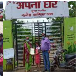
Birth party Expenses Donated to Orphan house