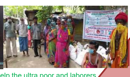
During lockdown activities due to COVID-19 effect to help the ultra poor and laborers