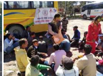
Holi Celebration with Trucker