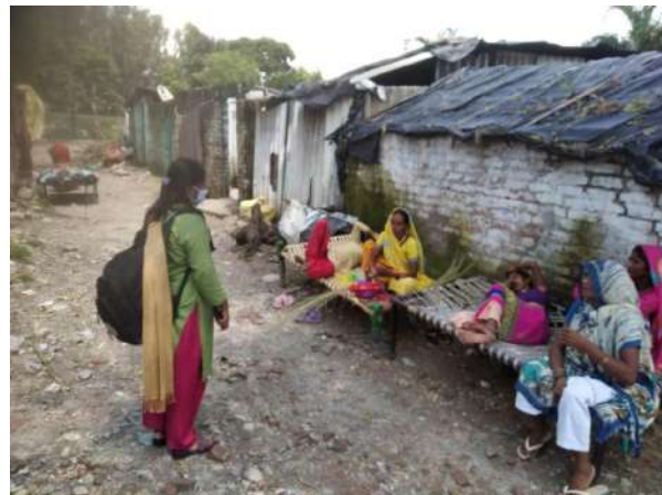
Counseling session for the migrants

Under this HIV-AIDS (Target Intervention) Program last year 2019-20 cover more than 15000 migrant population in Dehradun district and provide them all services including organize a free health camp, medicine distribution free testing, condom distribution for these migrant population