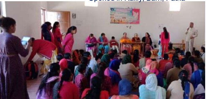
Women's Day Celebration in Nakronda