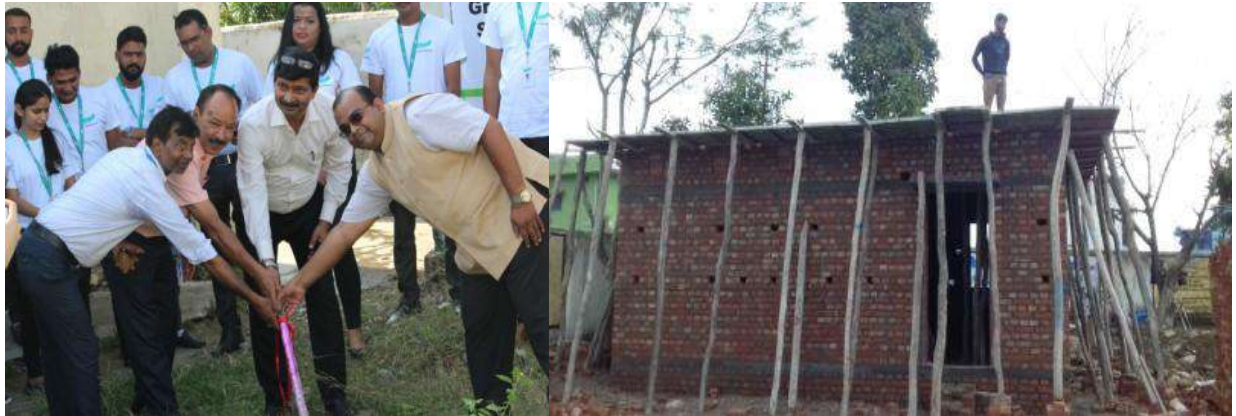
Groundbreaking ceremony of Toilet Complex 20

Balajee Sewa Sansthan is constructing low cost toilets in Patna & other districts of Bihar. The poorest of the poor are selected for constructing toilets in their houses. Poor having no disposable funds can contribute to the toilet construction through labor. Balajee has wide experience of construction of low cost toilets and so far constructed more than 2000 such toilets in 32 villages in 3 district of Bihar Constructed in last 8 years. In the year 2019-20, the organization with the help of there volunteer have constructed 30 toilets. For the construction of these low cost toilets the organization receive donations from Give India Platform.