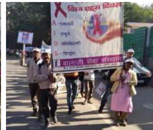
World AIDS Day Rally