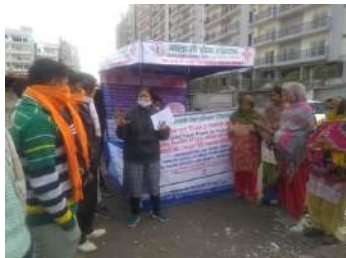
Youth Day Near ISBT