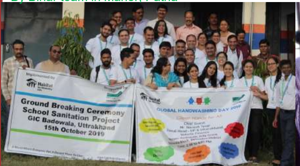
Handwash day celebration with INDO Star team in GIC Badowala