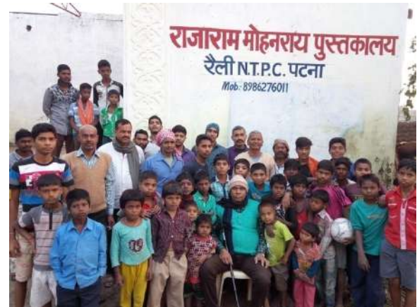
Library for the poor and rural students Opened in Raily, Barh, Patna