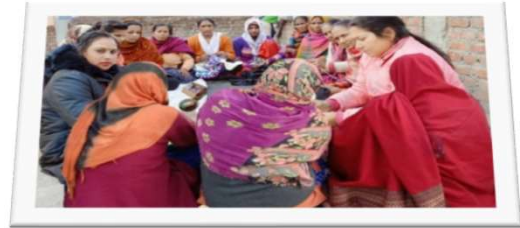
Self Help Group Meeting in Bareilly and Dehradun district