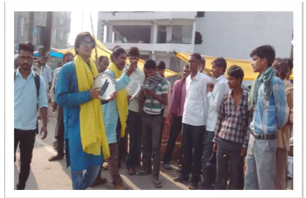
Counseling session for the migrants

Under this HIV-AIDS (Target Intervention) Program last year 2022-23 cover more than 15000 migrant population in Dehradun district and provide them all services including organize a free health camp, medicine distribution free testing, condom distribution for these migrant population