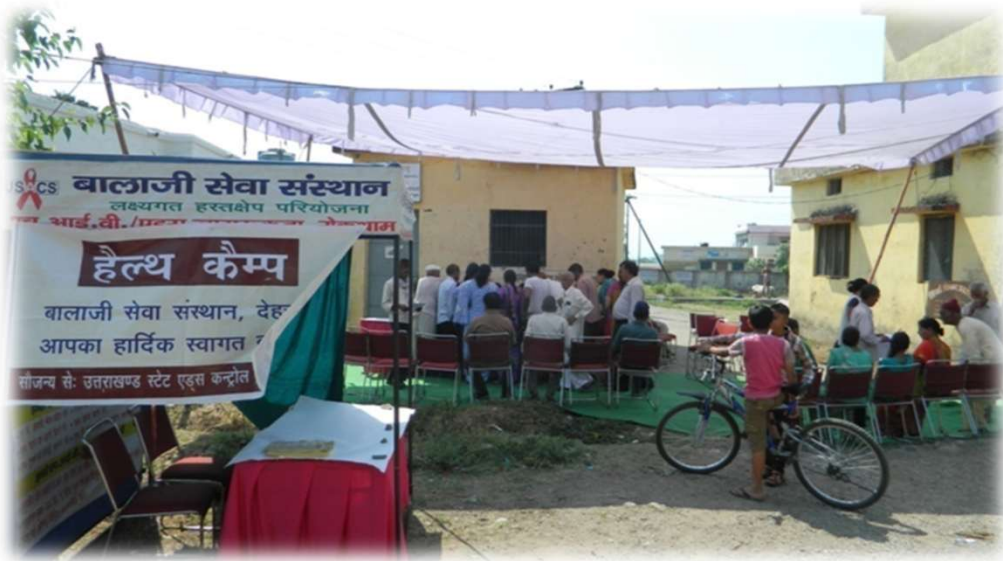
Health Camp organised by Balajee Sewa Sansthan

Under this HIV-AIDS (Target Intervention) Program last year 2022-23 cover more than 15000 migrant population in Dehradun district and provide them all services including organize a free health camp, medicine distribution free testing, condom distribution for these migrant population